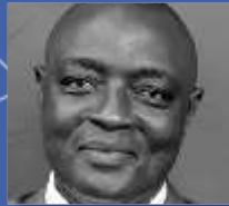
Hon. Ssempijja Bamulangaki Minister of Agriculture of Uganda