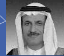
H.E. Sultan bin Saeed Al Mansoori. Minister of Economy