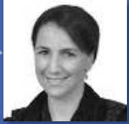
H.E. Mariam Saeed Al Muhairi Minister of State for Future Food Security United Arab Emirates