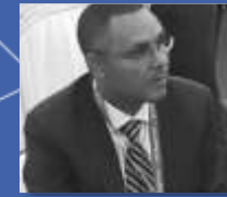
His Excellency Ayana Zewdie Workneh State Minister of Trade Democratic Republic of Ethiopia