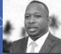
Hon Mike Mbuvi Ssonko Governor Nairobi City Republic of Kenya