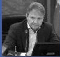
H.E. Alexander Tkachev Minister of Agriculture Russia Federation