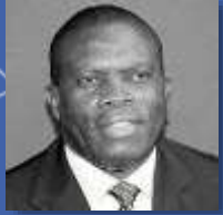
Hon Werikhe Micheal Minister of Trade, Industry and Cooperatives Republic of Uganda